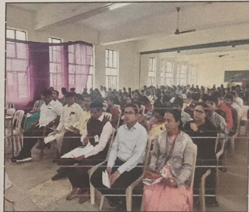
Faculty were present for programme.