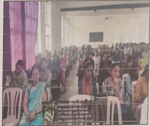
Student during the Student Induction Programme.